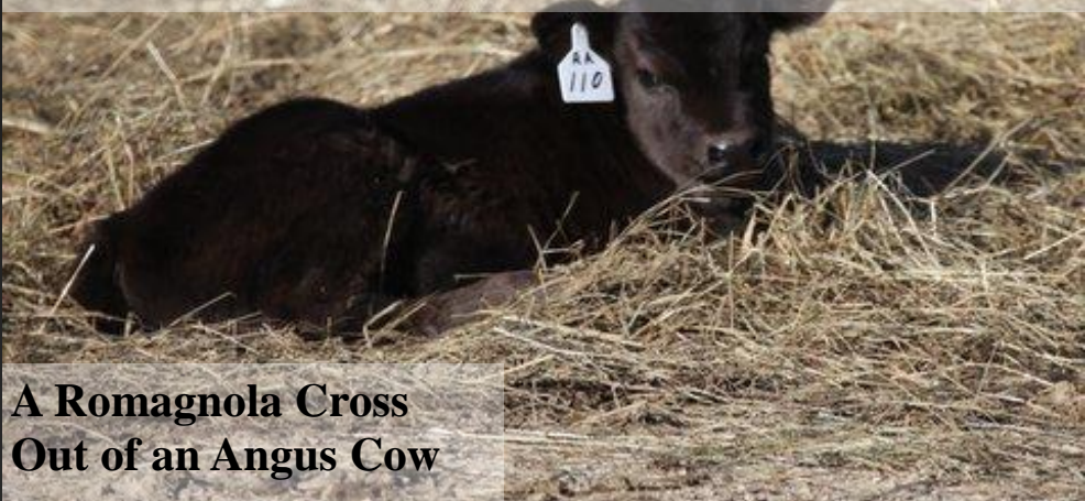
A Romagnola Cross Out of an Angus Cow

Romagnola bulls can produce calves that are lively, grow quickly, and produce tremendous muscular carcasses that can yield in the 65% range or better, even when bred to inferior cows. The meat is tender, moist, lean, and full of flavor.