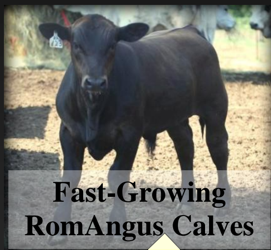
Fast-Growing RomAngus Calves

muscle that cuts choice. A RomAngus Calf will add 3+ pounds of choice-cut beef per day and good leg bones to its carriage.