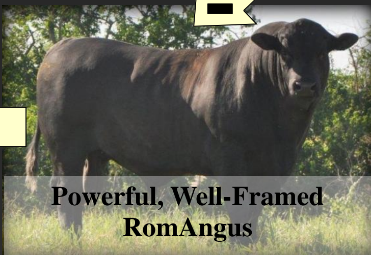
Powerful, Well-Framed RomAngus

Romagnola RomAngus Association 14305 W. 379th St. LaCygne, KS 66040 Office: 913.594.1080 ♦ www.romagnola.com ♦ office@romagnola.org